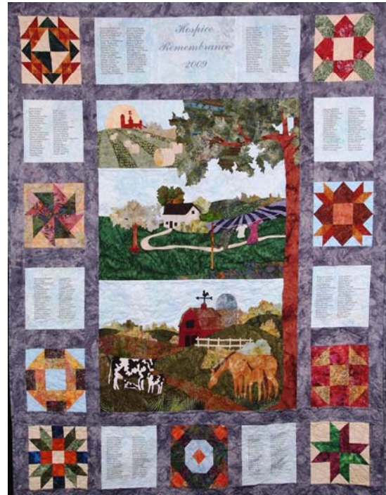
The newest Hospice Remembrance Quilt contains over 300 names of those patients served by the NWHC Hospice Program in 2009.