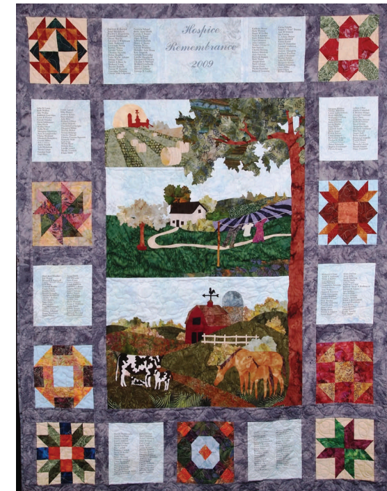
The newest Hospice Remembrance Quilt contains over 300 names of those patients served by the NWHC Hospice Program in 2009.

Nov/Dec Mondovi Luther Midelfort Oakridge 611 1st Ave