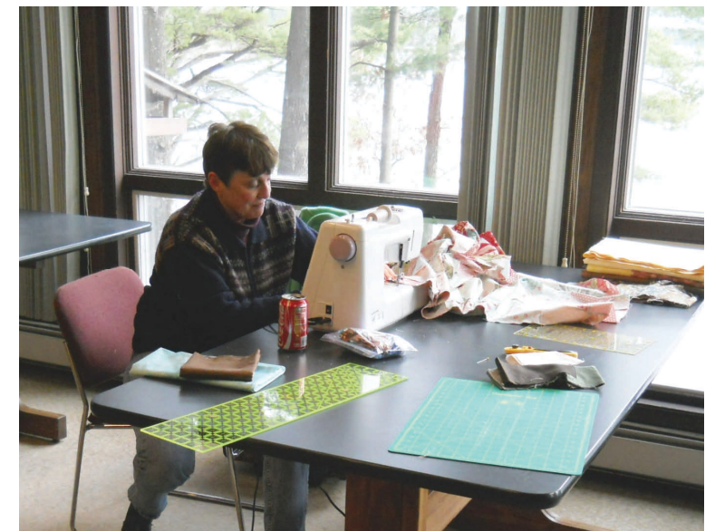
2010 Hospice Remembrance Quilt.

This year, the 'Sew Happy Quilters' quilt group is designing, piecing and quilting the